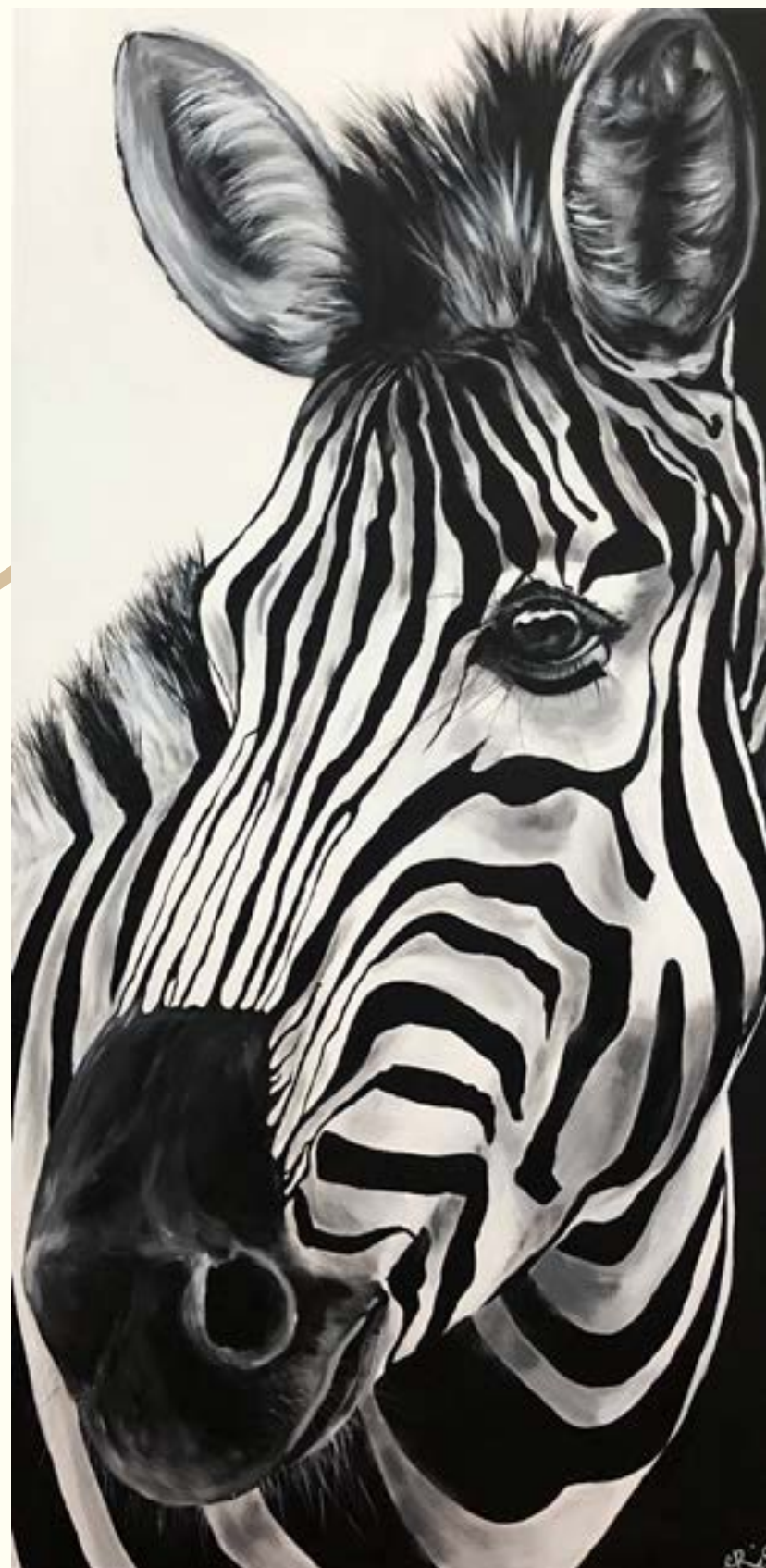
EARNEST INTENTIONS S$1800

The Artist was reminded of the Divine promise to us that we will be “called out of darkness into his wonderful light”. YES! With determination and faith, we will be able to get out of this.