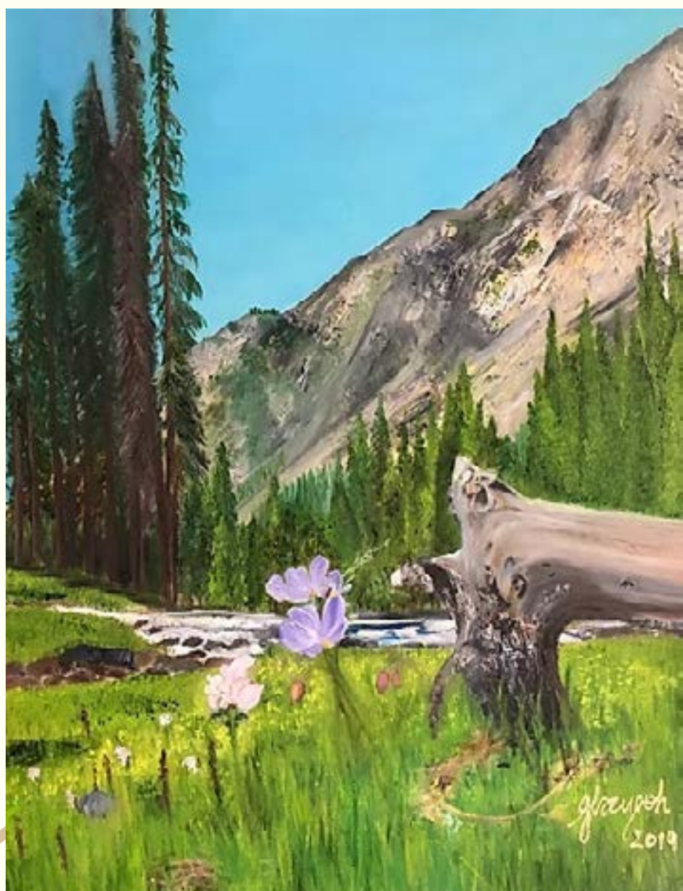
CONSIDER THE MOUNTAINS S$1500