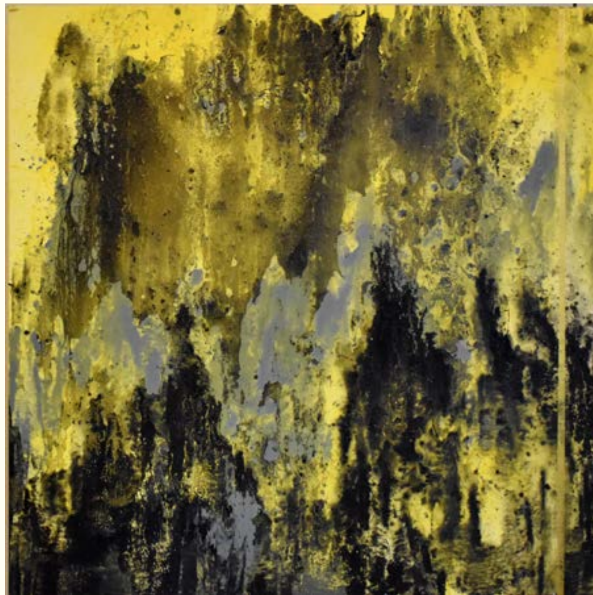
MORE THAN A CONQUEROR II S$3000