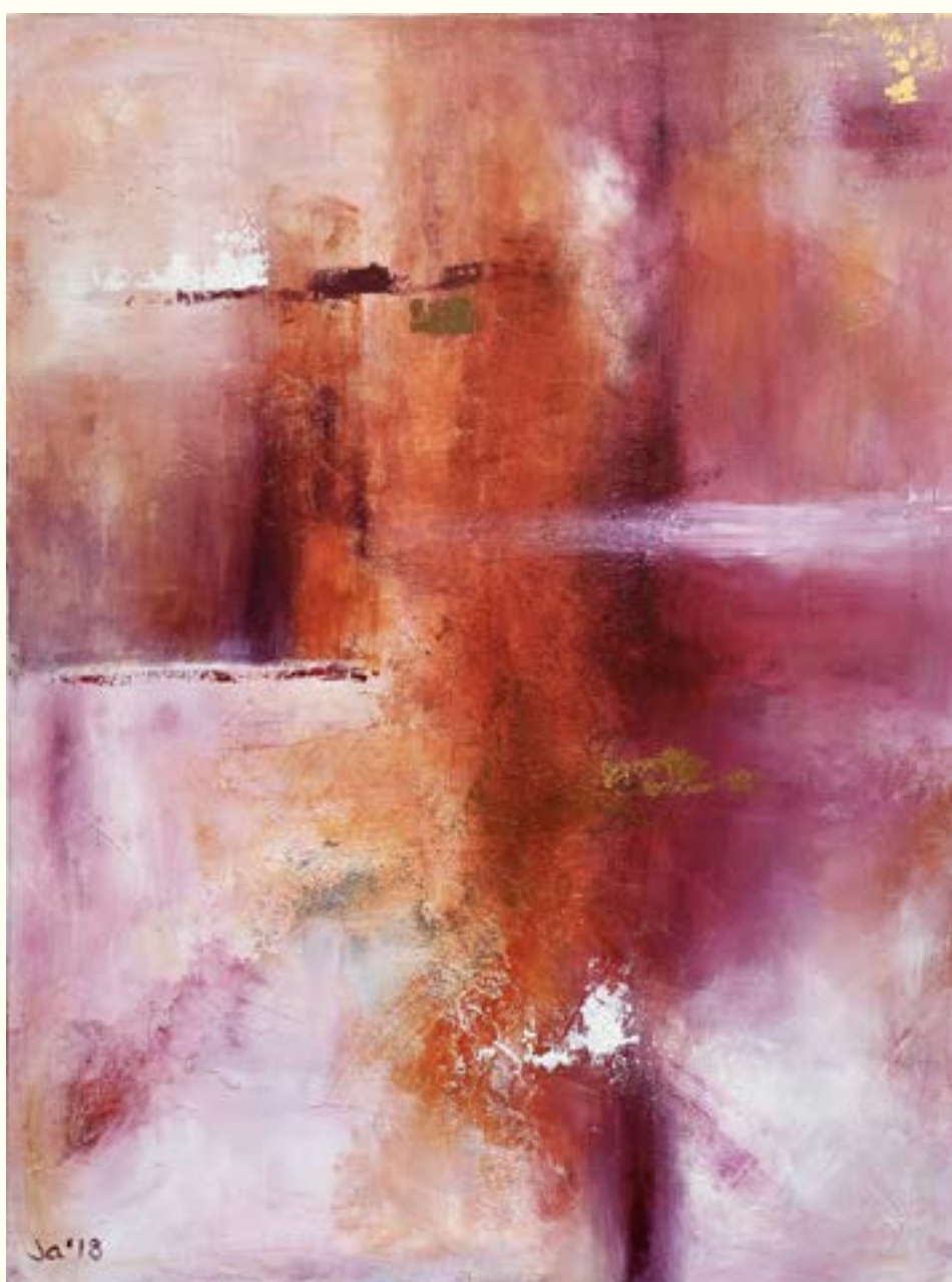
THIS IS MY SONG S$2000

This piece was painted amidst the chaos of the Covid-19 pandemic. The vibrant yet tender pink hues speak of hope and joy. We are to shift our focus from dwelling on present circumstances, to praying and trusting God more instead. The artist has a strong conviction that this painting is meant to help raise funds for people affected by the crisis so that they can look forward to a better tomorrow.