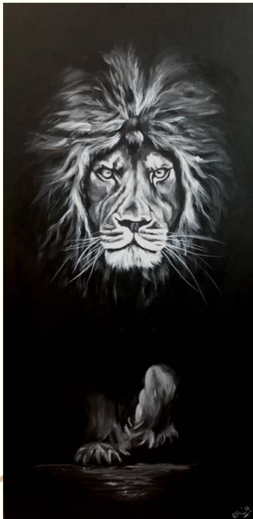
OUT OF DARKNESS S$1800