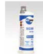
50ml Cartridge 10:1