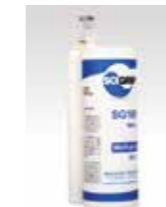
490ml cartridge for 10:1

Cartridges are supplied in boxes of 12 units with one nozzle per syringe/cartridge. Latest cartridge technology is used allowing resealing of part cartridges without cross-contamination with significant wastage reduction.