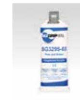
50ml Cartridge 1:1