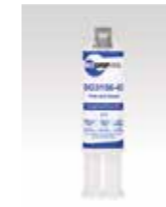
25ml twin syringe 1:1