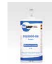
400ml cartridge for 1:1